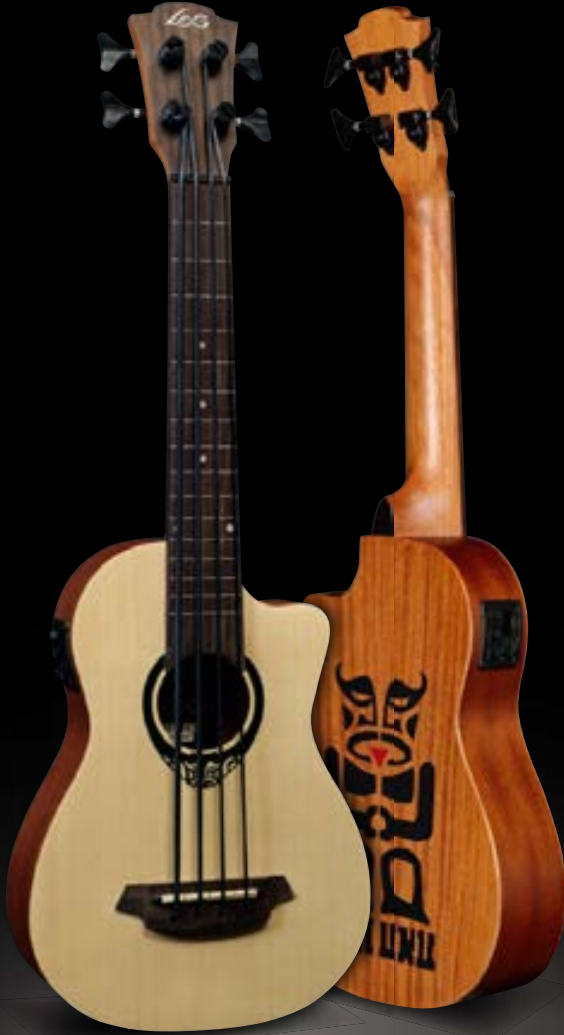
TKB150CE Mini Bass