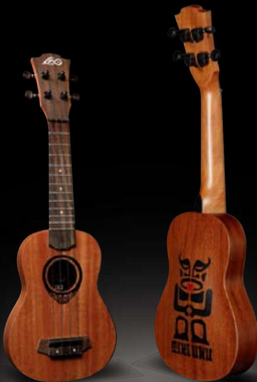
BABYTKU110S Soprano Slim