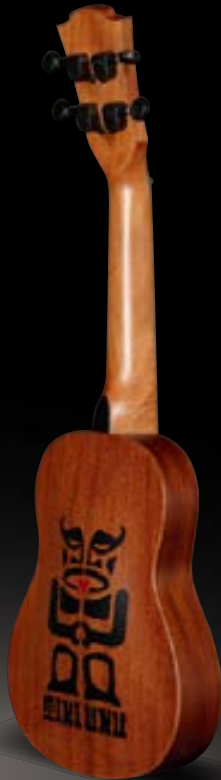
TKU130 Concert Slim