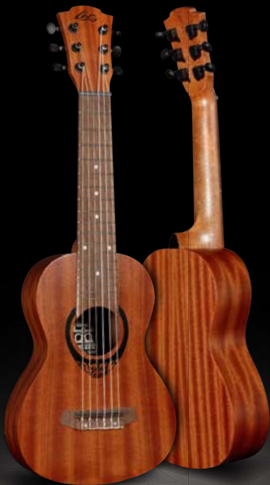
TKT8 Baby Guitar

Strings: Aquila guilele strings Gigbag: included