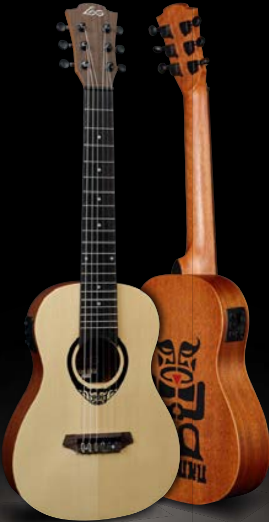
TKT150E Mini Guitar