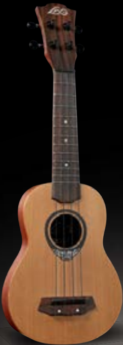
BABYTKU130S Soprano Slim