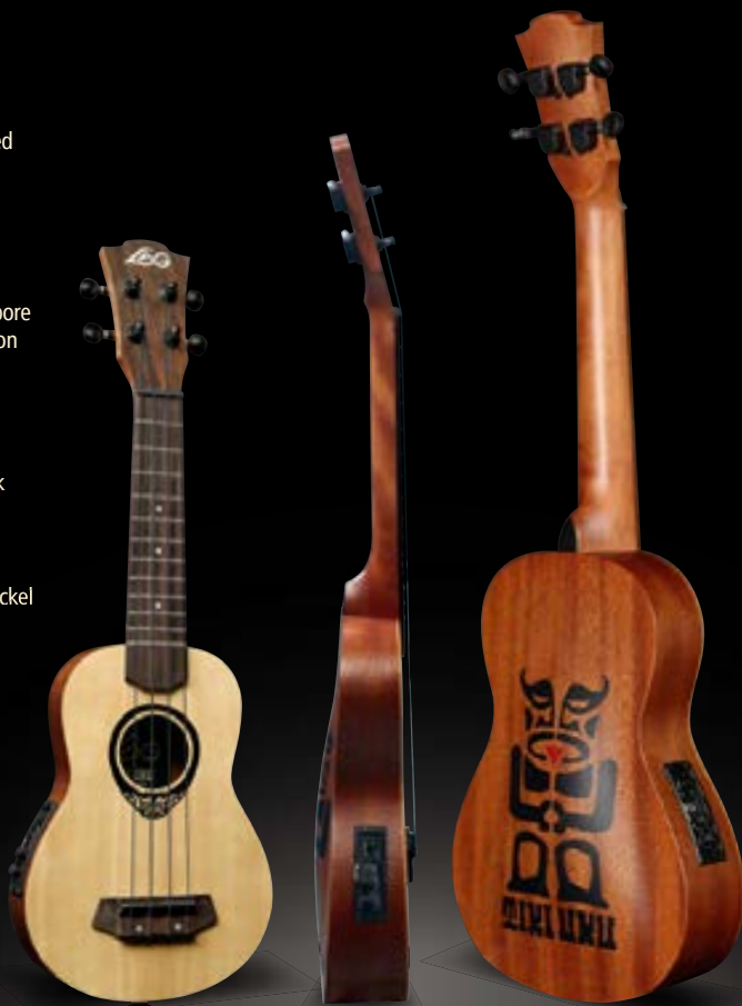
BABYTKU150SE Soprano Slim

Electronics: Shadow preamp system with tuner